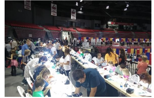
NIU STEMfest – 60 stations, 36 tables, 130 chairs, 6 Techs, 20 college students. – Building faster than two blinkie per minute.

At some point the general public's view of soldering shifted to something too dangerous. Kids can bicycle, ski, or toboggan, but don't use that soldering iron. It's too dangerous. The era of build and repair it your self was dying and companies like Heathkit and Radio Shack have faded into the sunset. Even today with the new emphasis on STEM education, we still hit multiple obstacles. Many events have to clear our appearance with the fire marshal and have it run it past the legal department. We are working to prove soldering is easy, and not a deadly activity.